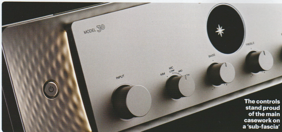
The controls stand proud of the main casework on a 'sub-fascia'

the Model 30 amplifier – is not just familiar, but almost identical to the layout you'll find in the company's 12SE series. That, in turn, means like the KI Ruby products the company launched a couple of years ago. And with the closeness of pricing between the 12SEs and the 30 Series – £3,000 per unit plays £2,700 here – surely that's going to spread some confusion?