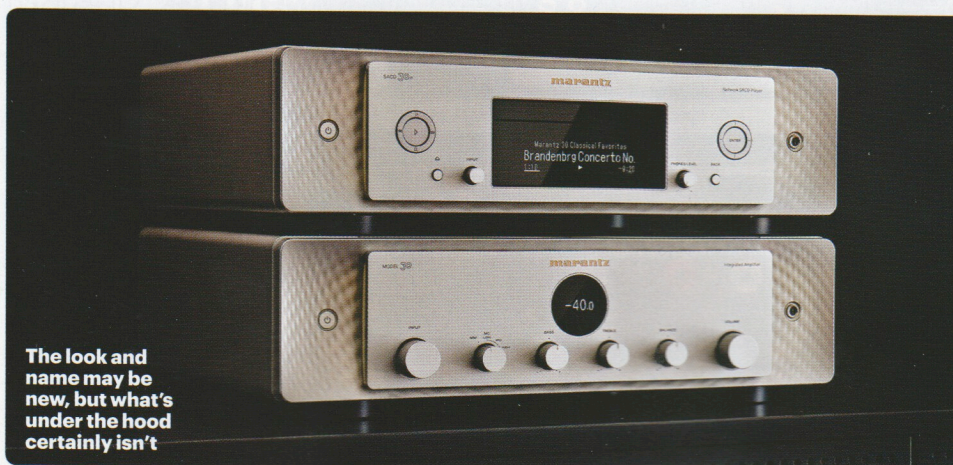
The look and name may be new, but what's under the hood certainly isn't